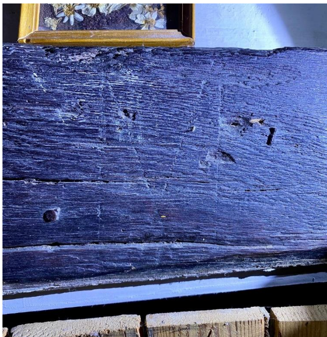
Attic – no apparent marks.